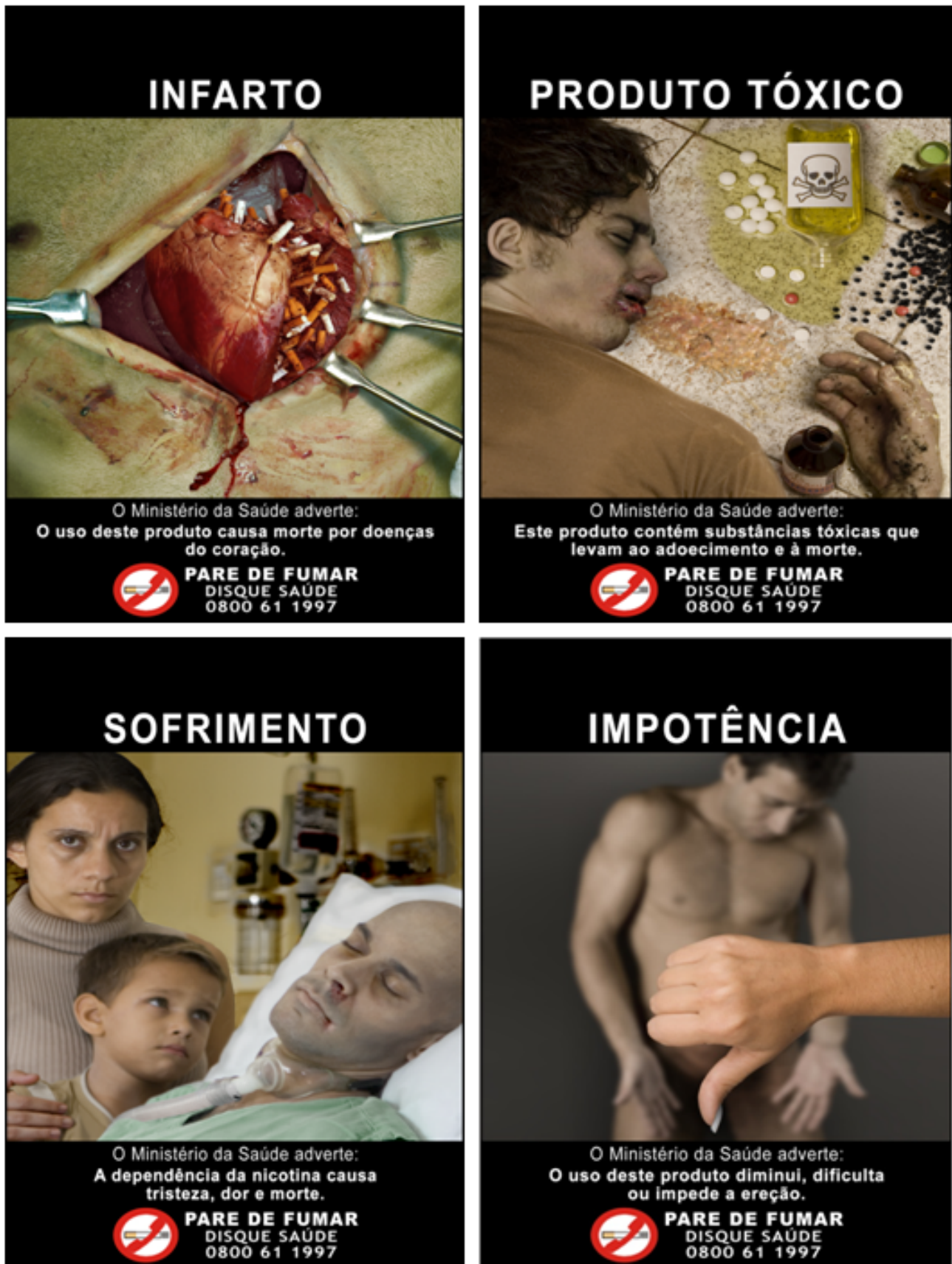
Figure 3. Examples of warnings on cigarette packages in Brazil. doi:10.1371/journal.pmed.1001336.g003